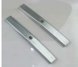
P/N 62 000 300 Manway Hatch Strong Back (Set of Two)