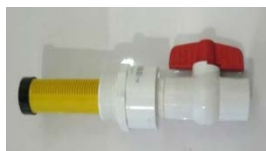
P/N 19 209 052 40 BSP Bulkhead Fittings c/w Locknut