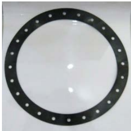
P/N 62 000 500 Round Hatch Gasket 560ø (earlier HS16 filters)