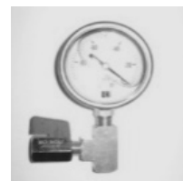
P/N 20 220 63-mm x 1/4" BSP Vacuum Gauge Only