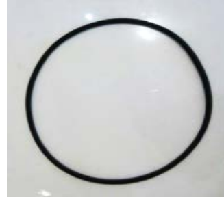
P/N 64 800 200 Prepump Strainer Lid "Rubber" Seal Only