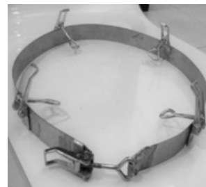
P/N 64 800 250 S.S Strapping band (c/w Toggle Clamps)