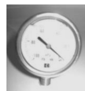
P/N 67 600 007 63-mm x 1/4" BSP Vacuum Gauge, Tee & Vent Valve Assembly