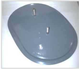
P/N 62 000 100 Elliptical Manway Hatch Moulding (ONLY)