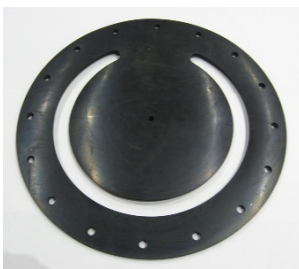
P/N 62 000 900 Screened Drain Cock Assembly 40 BSP