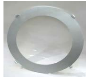
P/N 64 800 255 Prepump Strainer Rim only (c/w 4 Clips) - SS