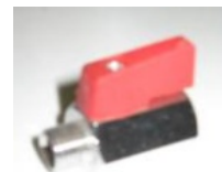
P/N 67 600 006 Mini-Ball Valve 1/4" Only