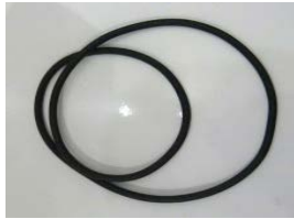
P/N 62 000 200 Manway Hatch O Ring Seal (Common for all Filters)