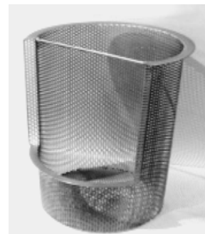
P/N 64 800 300 Perforated Strainer Basket Stainless Steel